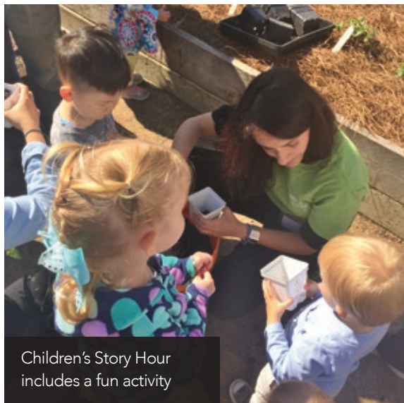
Children's Story Hour includes a fun activity