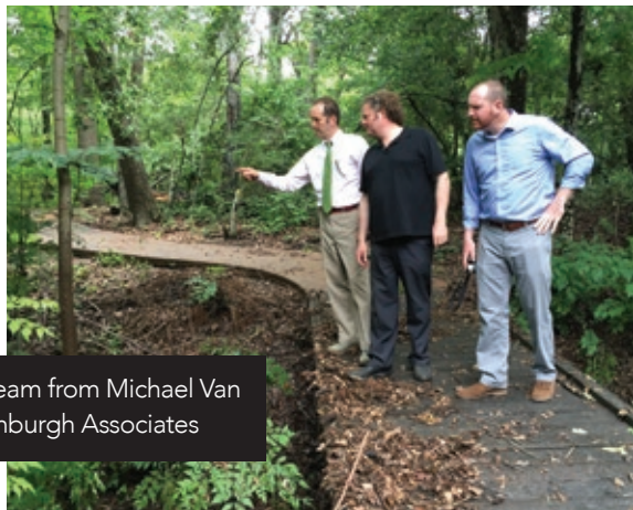
The team from Michael Van Valkenburgh Associates