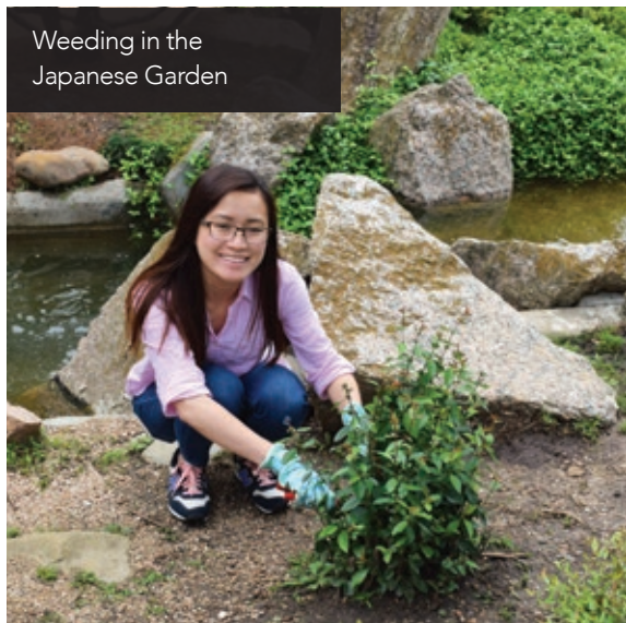
Weeding in the Japanese Garden