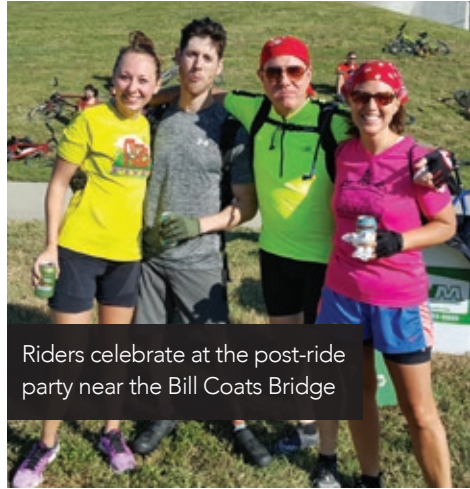
Riders celebrate at the post-ride party near the Bill Coats Bridge