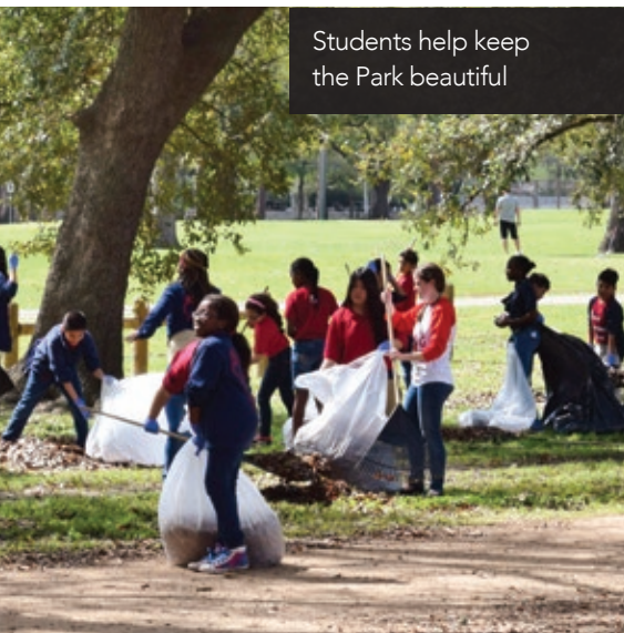
Students help keep the Park beautiful