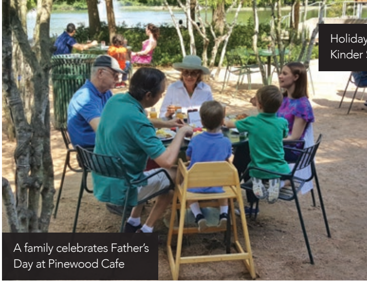
A family celebrates Father's Day at Pinewood Cafe