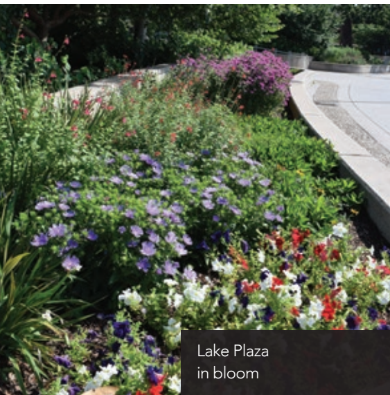
Lake Plaza in bloom

The McGovern Centennial Gardens volunteer team helped the garden staff by pulling weeds, planting and harvesting vegetables, trimming plants, greeting visitors, and reading stories at a weekly children's story hour. Japanese Garden volunteers aided Houston Parks and Recreation staff by weeding, trimming ferns, and placing pine straw.