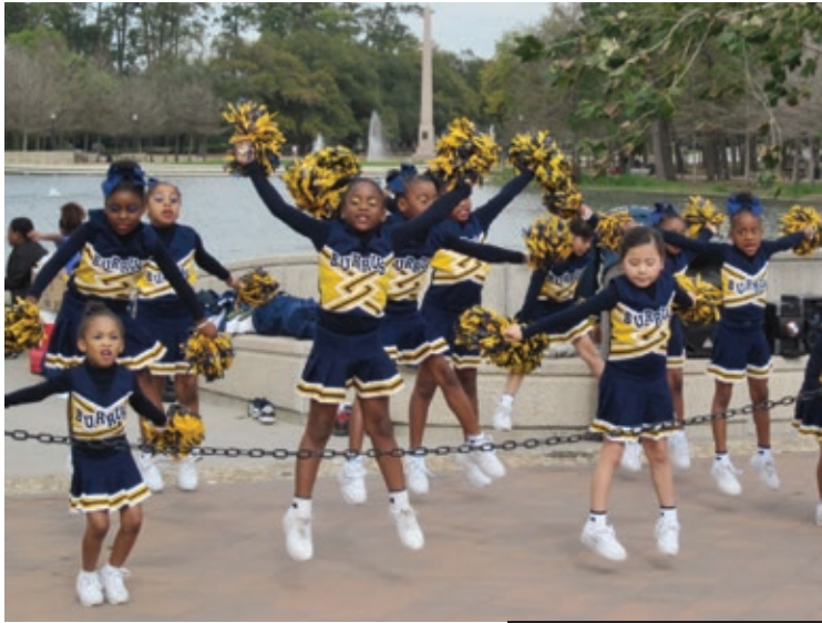
Burrus Elementary School Cheerleaders