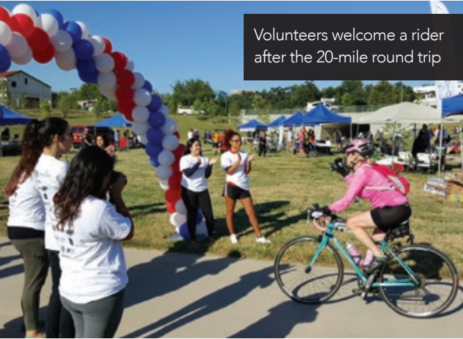
Volunteers welcome a rider after the 20-mile round trip